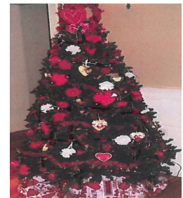
All Holiday's Tree!